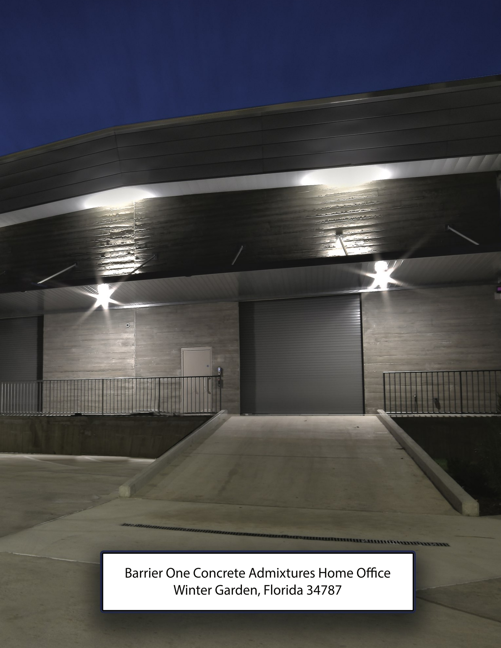
Barrier One Concrete Admixtures Home Office Winter Garden, Florida 34787